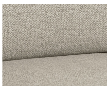
+ Upholstery Kari