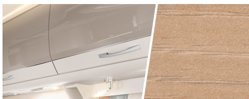
+ Wood décor Noce Nagano