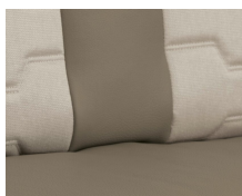
+ Upholstery Nubia